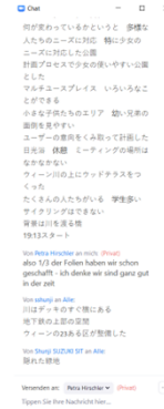
Online lecture series