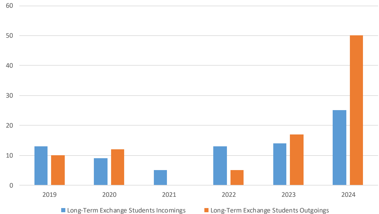
Long-Term Exchange Students (6-12 months)

This year, we have a peak of about 50 Outgoing and 25 Incoming students.