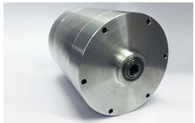
Sensorless controlled synchronous motor without rare-earth metals